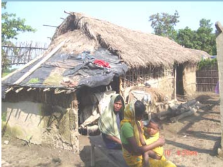
Old Home in Nepal

Nepal has a population of 28.9 million people. Migration and urban growth have resulted in a serious shortage of adequate housing in towns and cities, which leads to crowded living. The cost of a HFH Nepal home is $1,550, which gives the family a $7 per month mortgage repaid over a 3 year period.