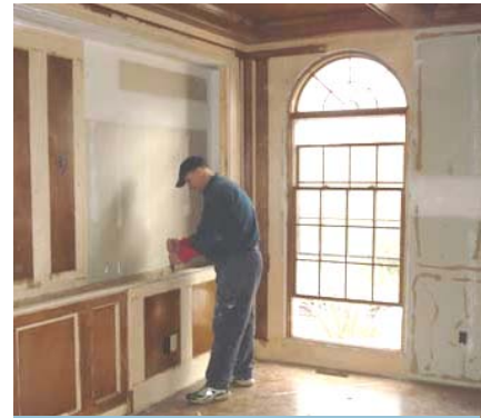
Home deconstruction—November 08

All of the funds raised by the Habitat ReStore are directly allocated to the Habitat affiliate for the construction of homes in St. Charles County. The ReStore hopes to one day raise enough funds to